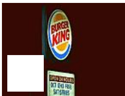
Burger King to give free satisfries