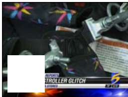
Consumer Reports: Heidi Klum str...