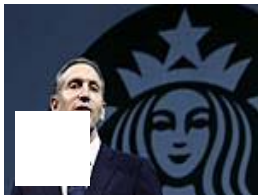
Starbucks petition urges Congress t...